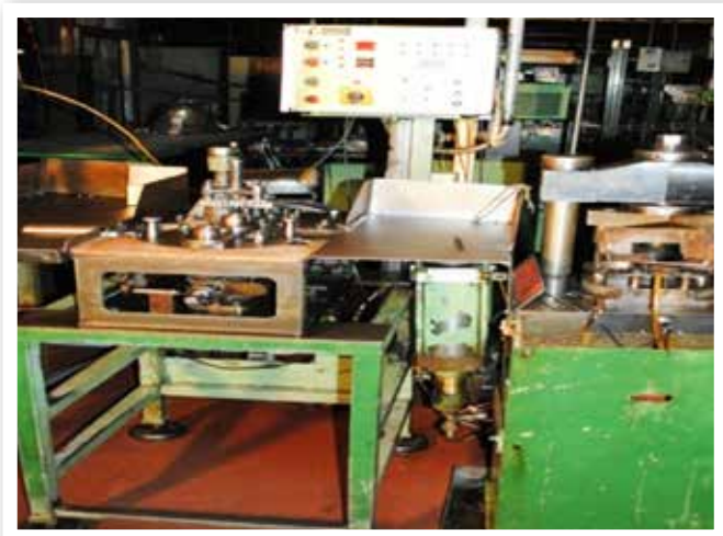
Machines for control, manufacturer: Institute "Mihailo Pupin"