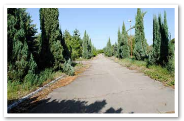
Infernal traffic routes (roads)