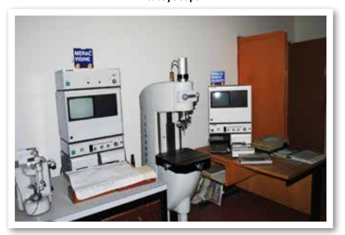
Machine for testing circularity and roughness HOBBSON & TAYLOR (England)