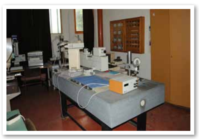
Three-dimensional testing machine Mitutoyo Japan